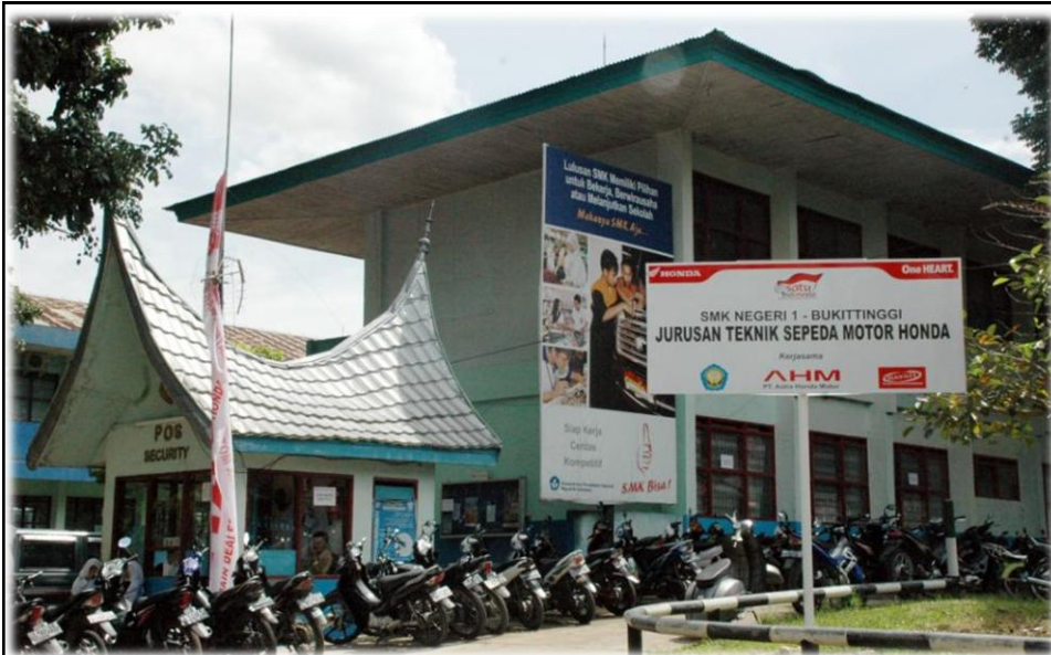
SMK NEGERI 1 BUKITTINGGI – SUMATERA BARAT SMK Binaan Astra Honda Motor