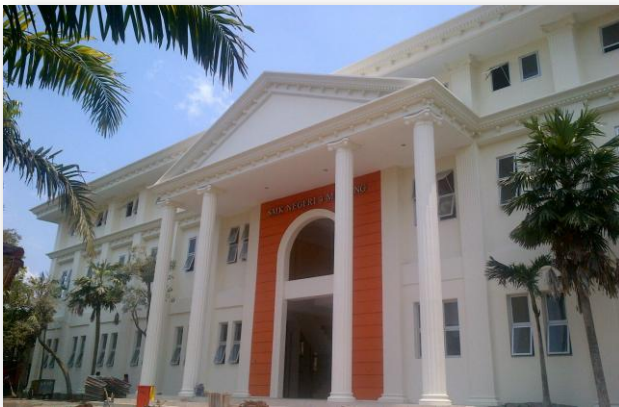
SMKN 4 MALANG, EAST JAVA