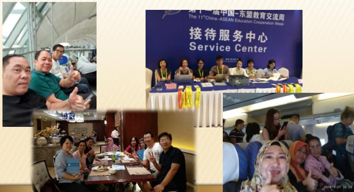
50 Years of Education Cooperation for Regional Sustainable Development