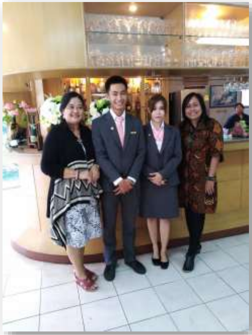
Welcome Coordinators from GANESHA University of Education to WBAC