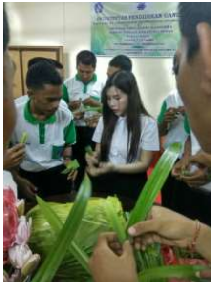
WBAC Students demonstrated how to make Thai craft