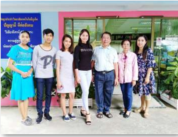
Welcome Students from MINSCAT to PTECH