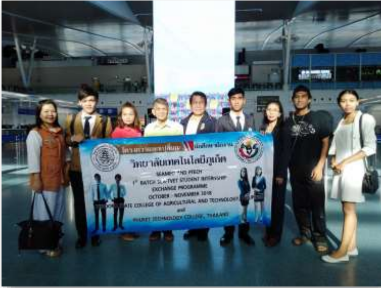
PTECH Students departed to MINSCAT