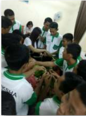
WBAC Students demonstrated how to make Thai craft