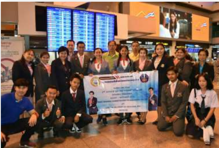
WBAC Students departed to Bali