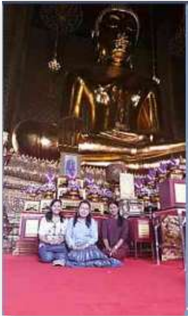
Weekend Activity's GANESHA students